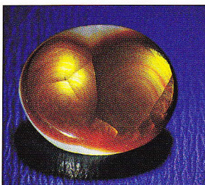
Fire agate cabochon from Deer Creek, Ariz., measures about 2mm x 1.5mm.

One fire agate is never just like another, to the delight of one-of-a-kind gemstone fanciers and chalcedony lovers. But this one-of-a-kind allure makes fire agates hard to price, say dealers, and dollar figures fluctuate widely. At the Tucson gem and mineral shows each year, for example, buyers may rummage through parcels of fire agates wholesale priced anywhere from $1 to $200 per carat. Dealers often command even higher prices for very brilliant, color-saturated and larger gems.